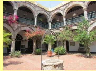
La Popa Convent

Visit Castillo San Felipe . This fort is the largest Spanish fortification in the Americas and dominates the old town.