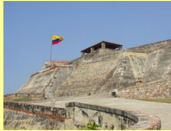
San Felipe Fortress