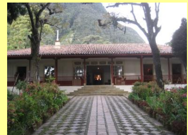
Quinta de Bolivar

Walking distance from the old town, we find the base of the Monserrate hill . At the top of the hill, that can be reached by cable car or funicular ride, we will visit the the Monserrate Monastery and will also enjoy great views of the city of Bogota.