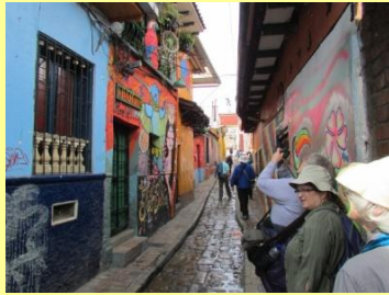
Streets of La Candelaria