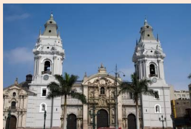
Basílica Catedral de Lima