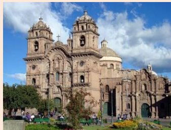
Compañía de Jesus Church