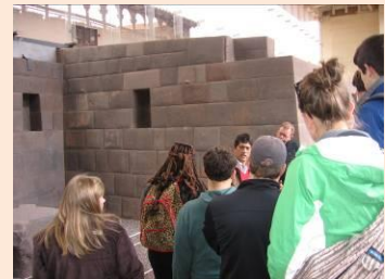
Qorikancha Stone Walls

Start your tour in the Plaza de Armas , the main square, featuring the imposing colonial-era Cathedral , a baroque-style structure built on the foundations of an Inca emperor palace.