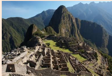
Huayna Picchu Classic View