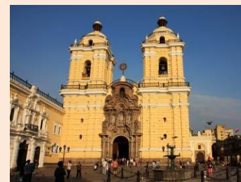
San Francisco Monastery

Visit Lima's historic center for a walking tour of the principal landmarks of the city's history, including the Plaza Mayor , one of South America's biggest central squares. Main attractions are the neo-colonial Palacio de Gobierno (Presidential Palace), the Municipalidad de Lima , and the Basílica Catedral de Lima , the city's main cathedral dating back to 1535.