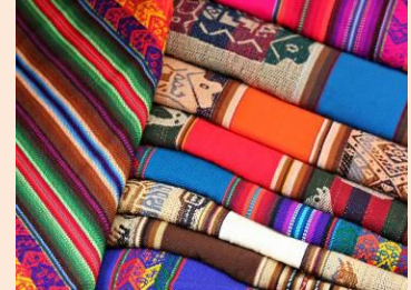
Arts & Crafts Market

Enjoy a full-day trip outside of Cuzco to the Sacred Valley . Take in the beautiful mountain scenery on your journey to the town of Pisac , an archeological site 18 miles northeast of Cuzco, where the Sacred Valley starts.